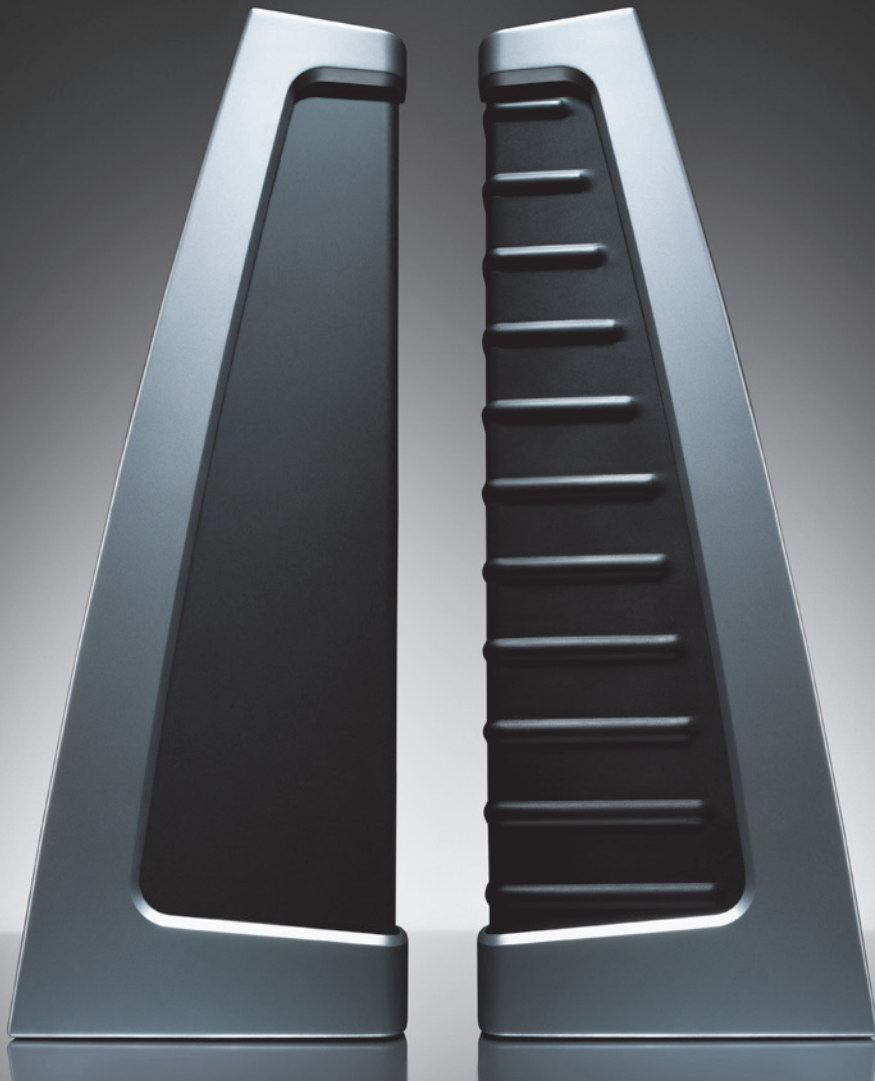
Flextight X1 and Flextight X5